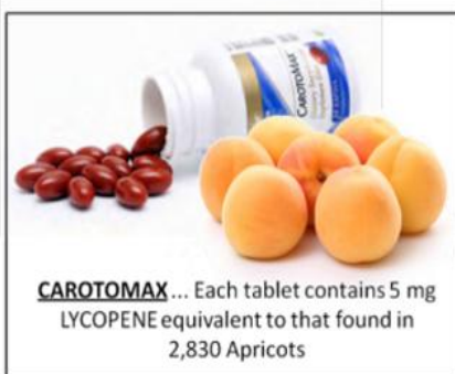
CAROTOMAX ... Each tablet contains 5 mg LYCOPENE equivalent to that found in 2,830 Apricots